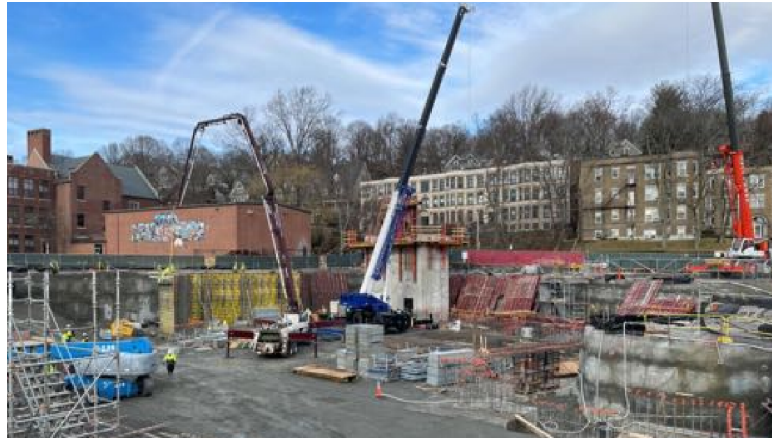
Forming and placing walls along the CY line adjacent to the existing school. (Photo Below)

Completed all perimeter foots at Building C & Building A Shear Core C in progress. (Photo Below)